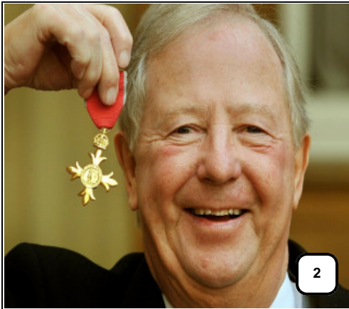
Died in 2020